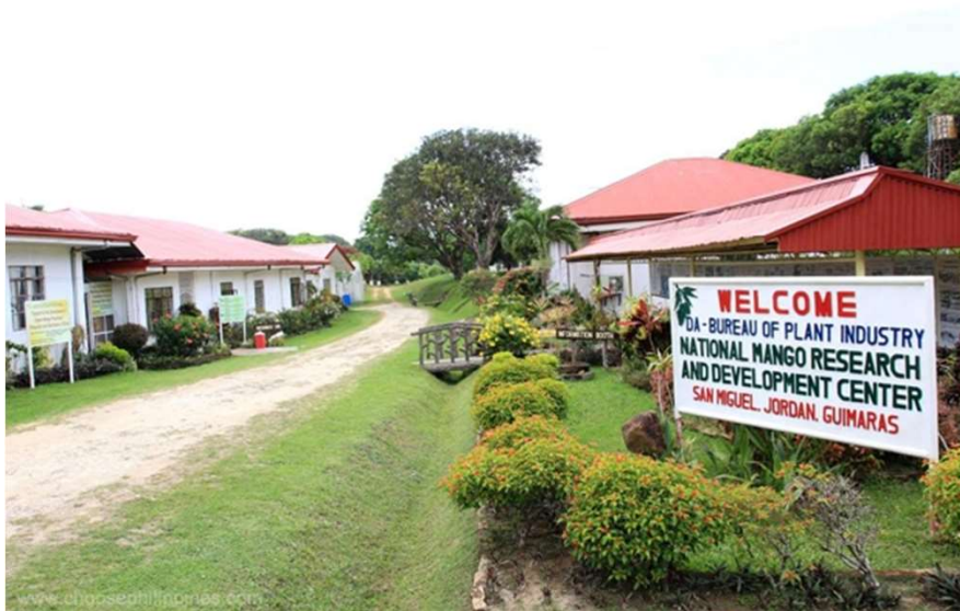
Mango Research Center