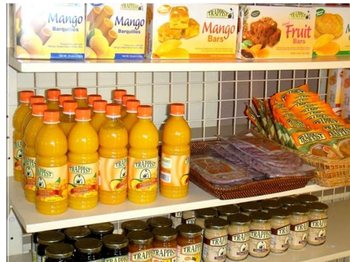
Mangoes Pasalubang Center