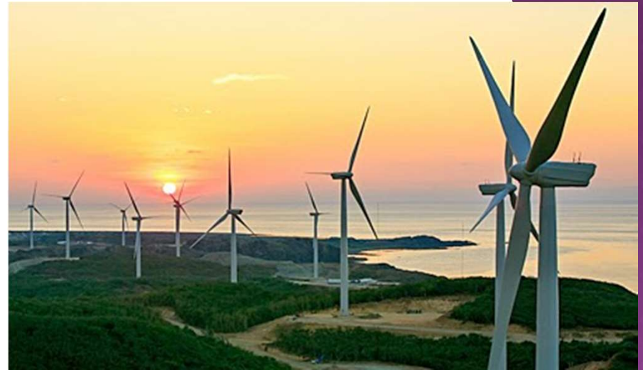
San Lorenzo Windmills