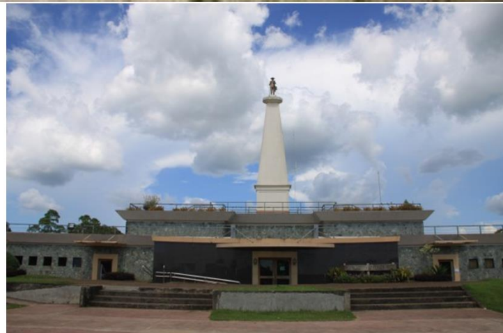
Museo de Guimaras