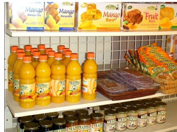
Mangoes Pasalubang Center