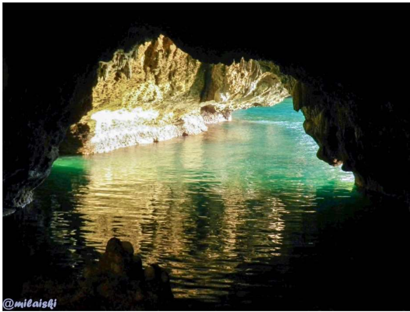
Baras Cave and Beach